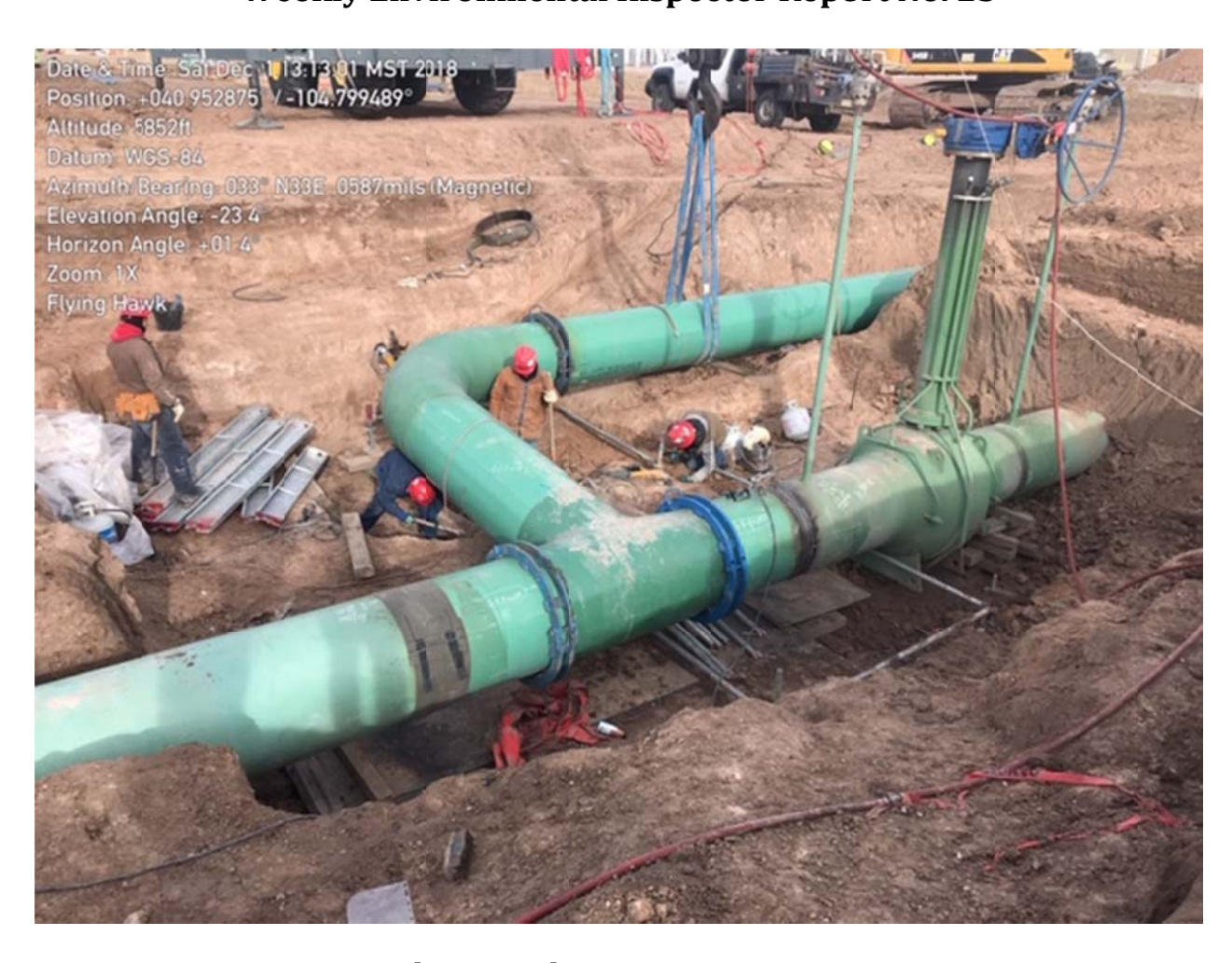
Flying Hawk Meter Station tie-in