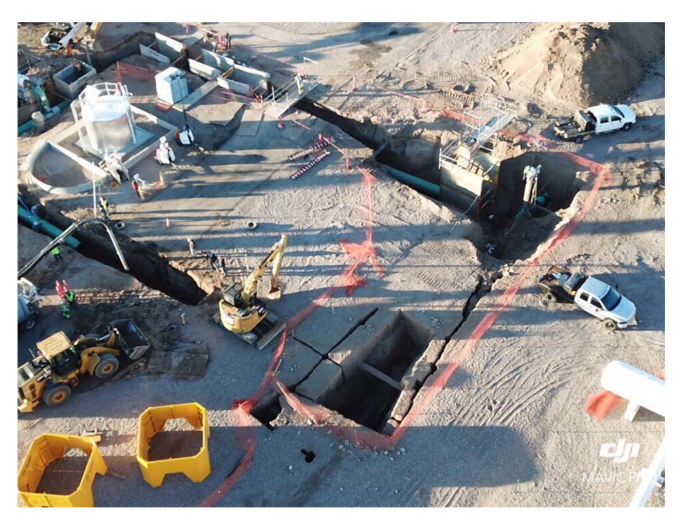
Excavation for the WIC compressor suction line tie-ins