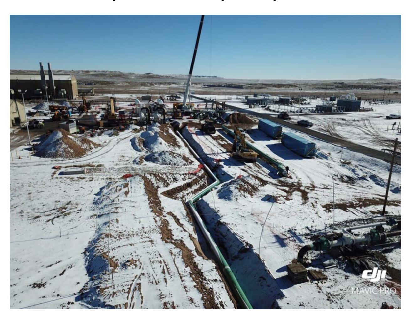
Plant-yard piping installed