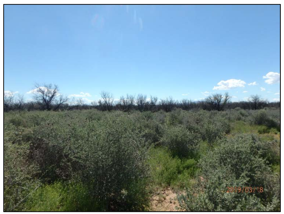
Milepost 6.3, view northeast.