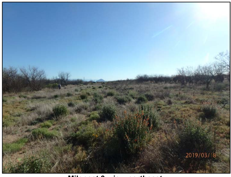
Milepost 8, view northeast.