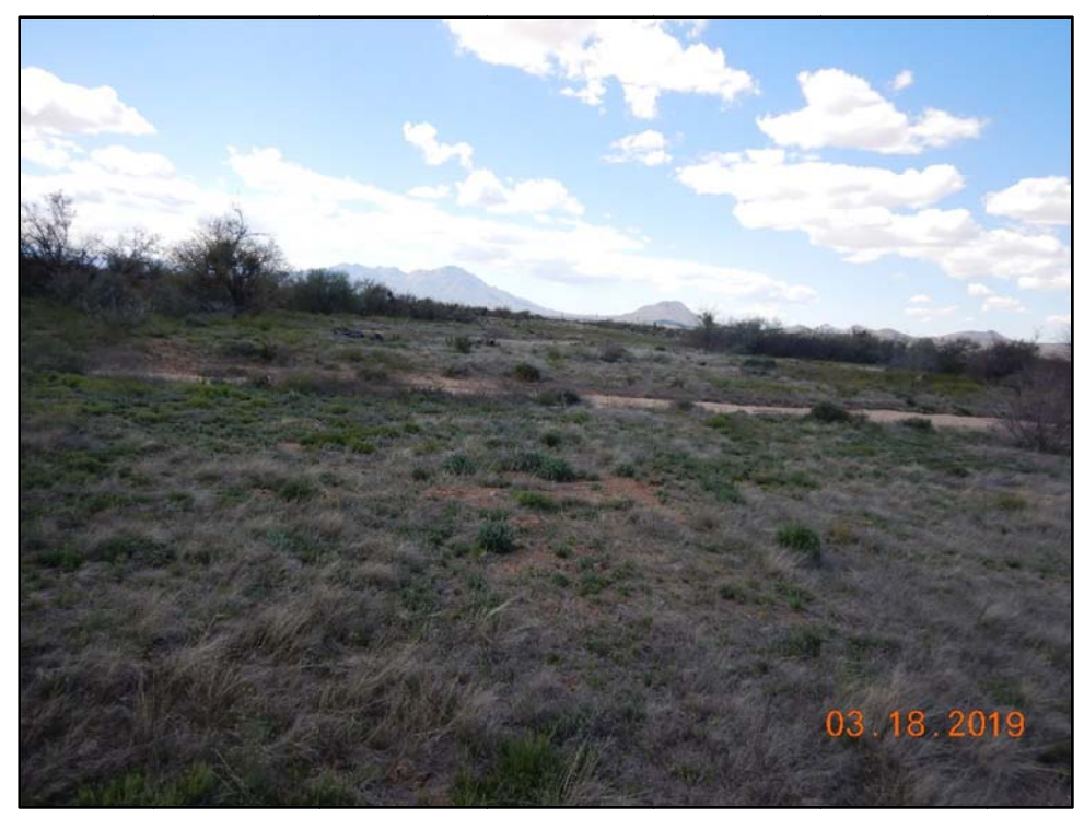
Milepost 14.6, view west.