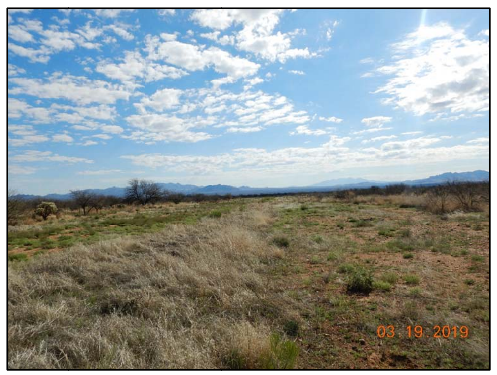
Milepost 36, view north.