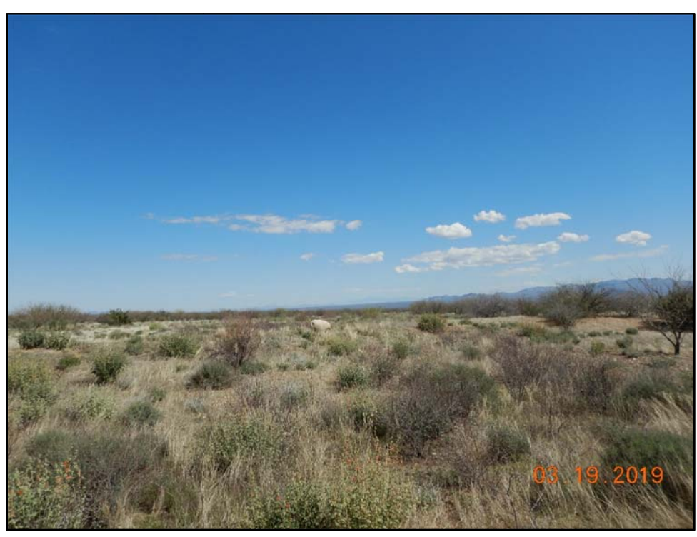
Milepost 38.2, view northeast.