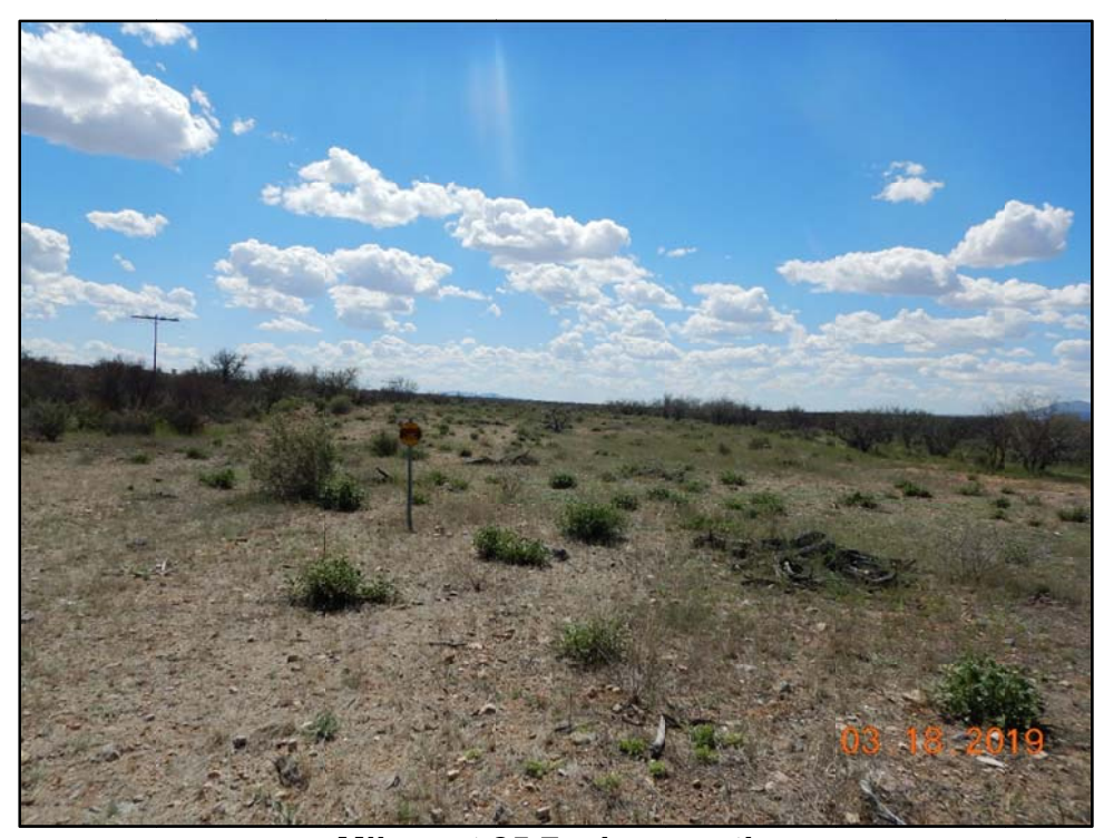
Milepost 25.7, view south.