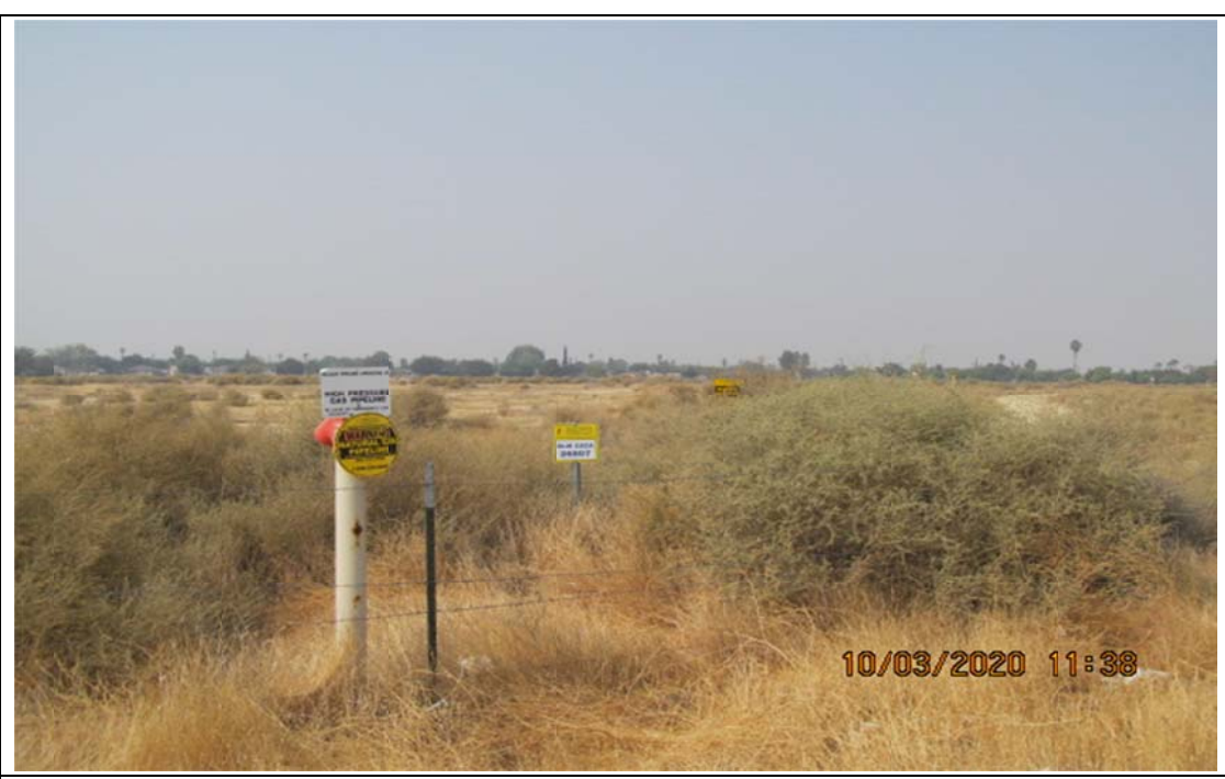
Photo No. 1: Segment 1 at Milepost 165+0017 on Line No. 1901 in Kern County, California Comments: Photo taken looking west from I-119. The BLM has concurred that restoration has been completed on this segment.