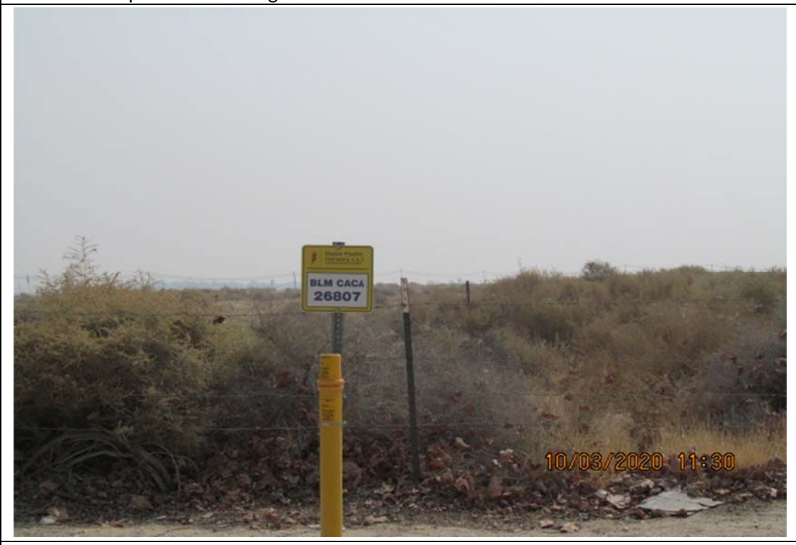
Photo No. 2: Segment 1 west of I-119 at Milepost 165+1680 on Line No. 1901 in Kern County, California.

Comments: Photo taken from Harrison Street looking east.