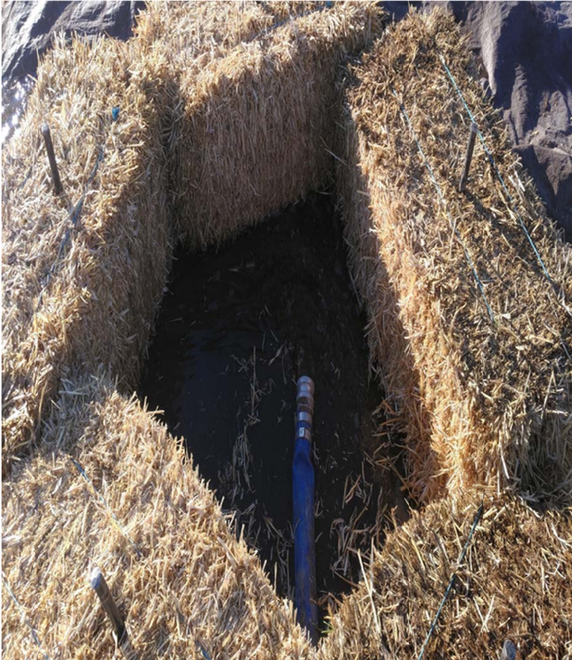
Photo No.3 – Hydrostatic test discharge location at Ramsey North Meter Station.