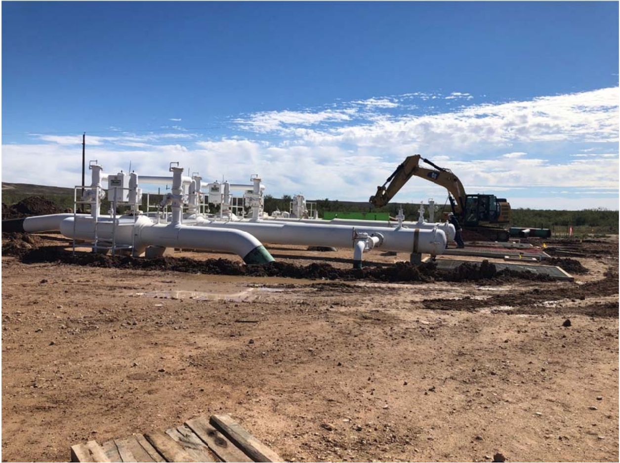
Photo No. 1 – Setting trench box at Pecos River Compressor Station.