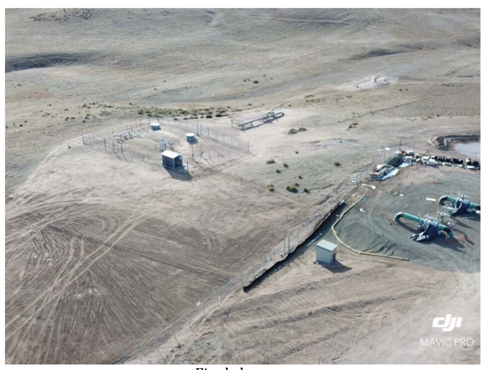
Final clean up