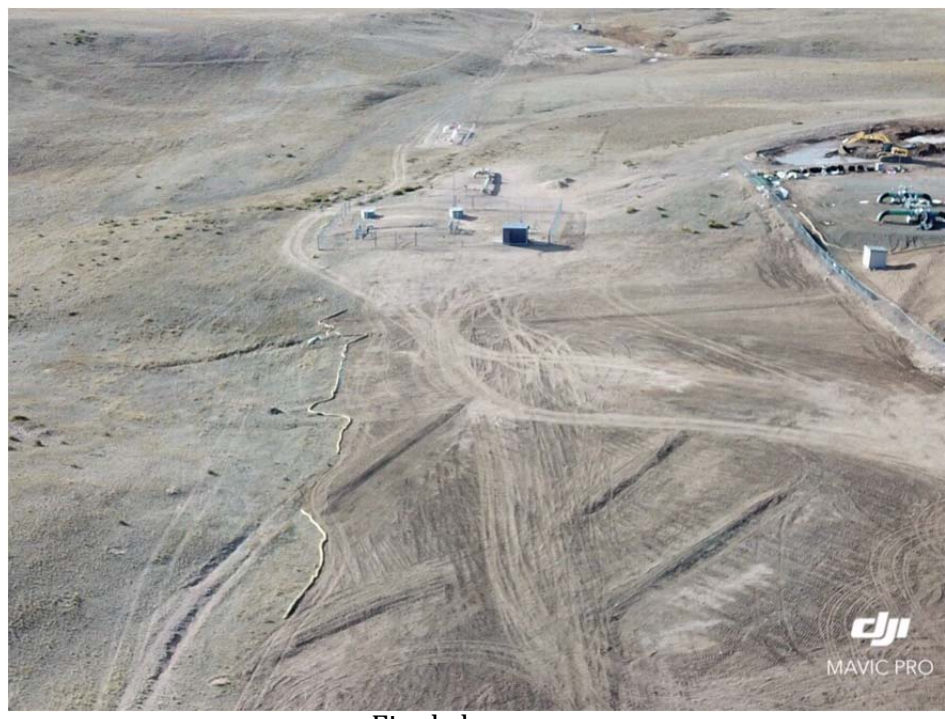
Final clean up