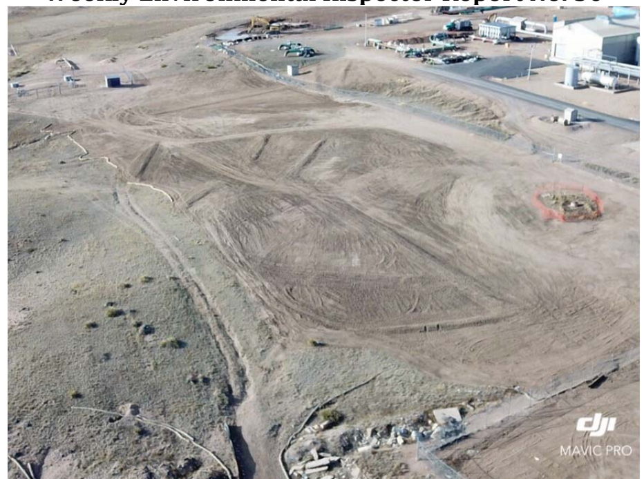
Final clean up

Weekly Environmental Inspector Report No. 30