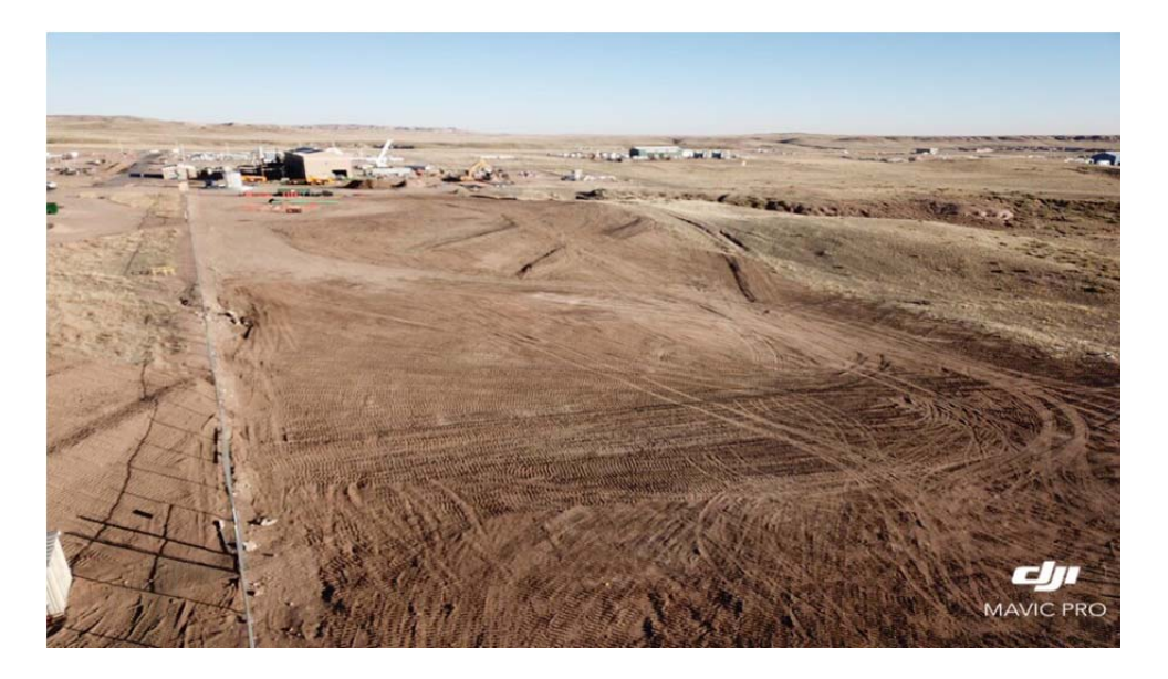
Water bars installed on the 24-inch pipeline ROW

Colorado Interstate Gas Company, L.L.C. CIG 2018 Line Nos. 5A and 5B Expansion Project Docket No. CP18-94-000 Weekly Environmental Inspector Report No. 26