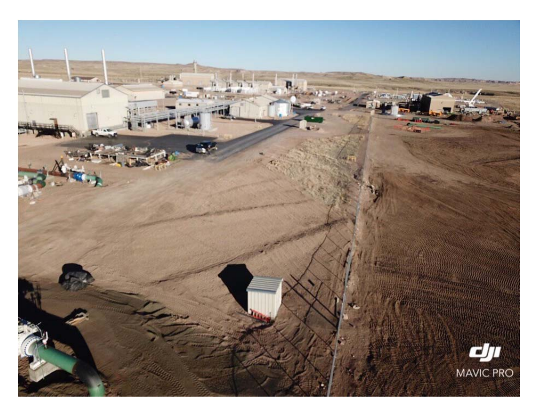
Clean up and water bars on the 24-inch pipeline ROW