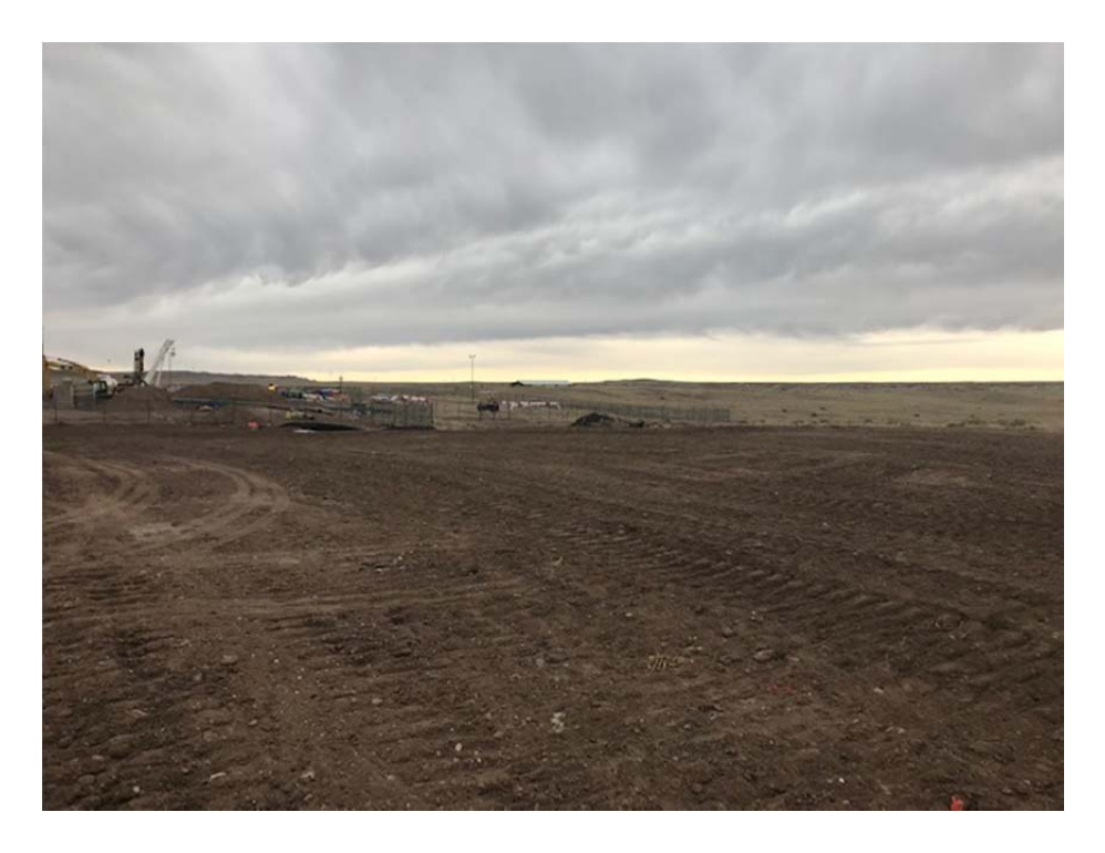
ROW after clean-up