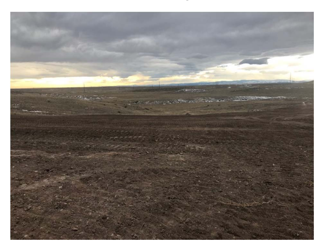
ROW after clean-up