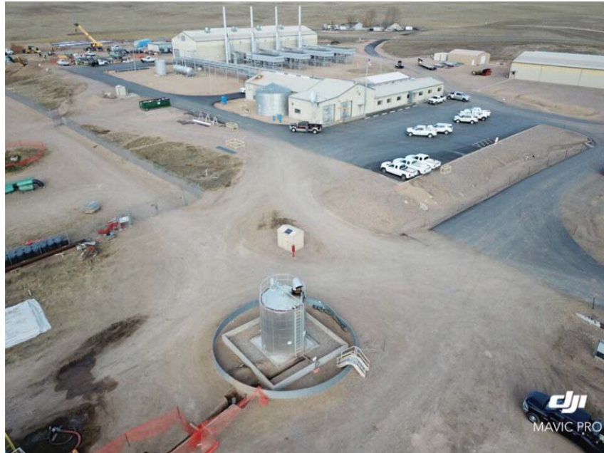
2-inch drain line installation