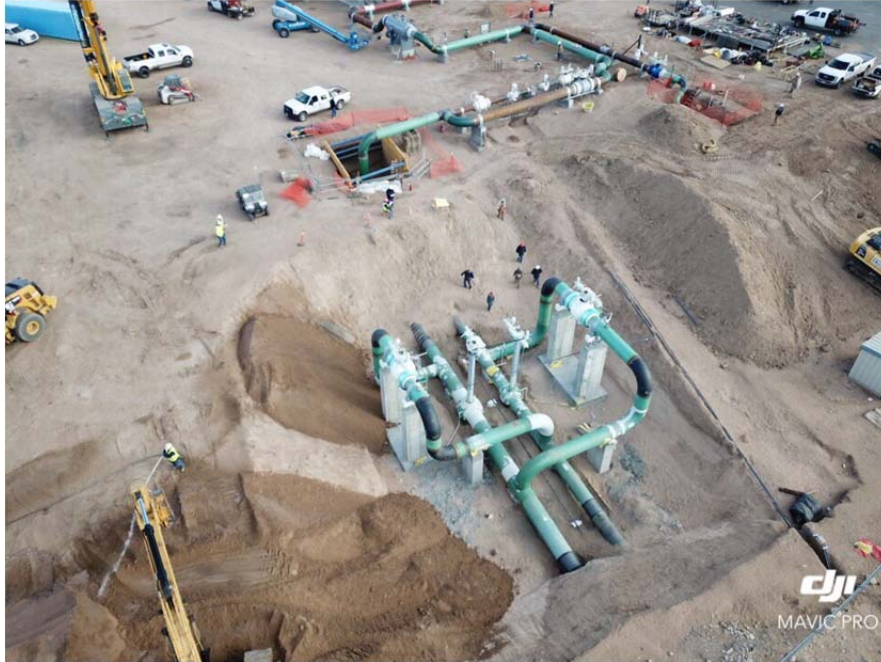
Backfilling of the bi-directional manifold