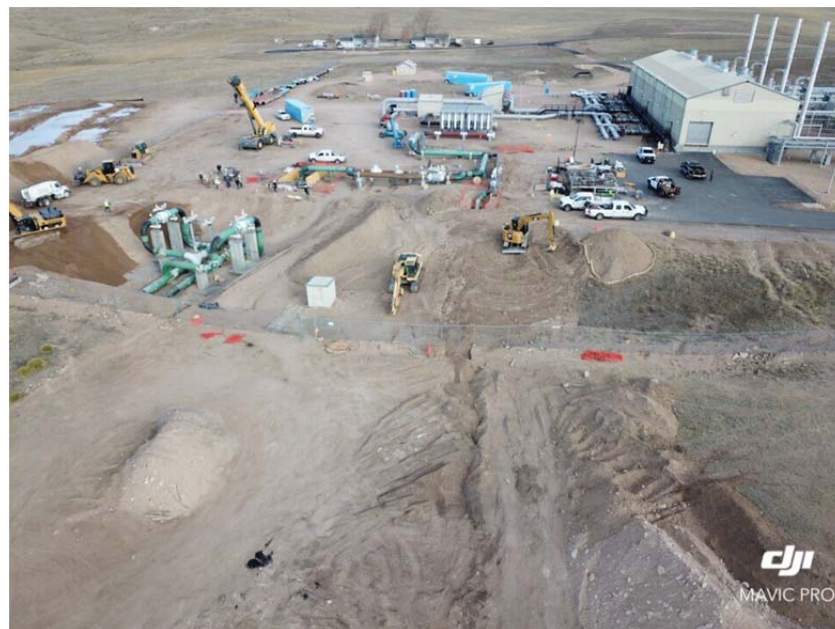
24-inch pipeline ROW clean up