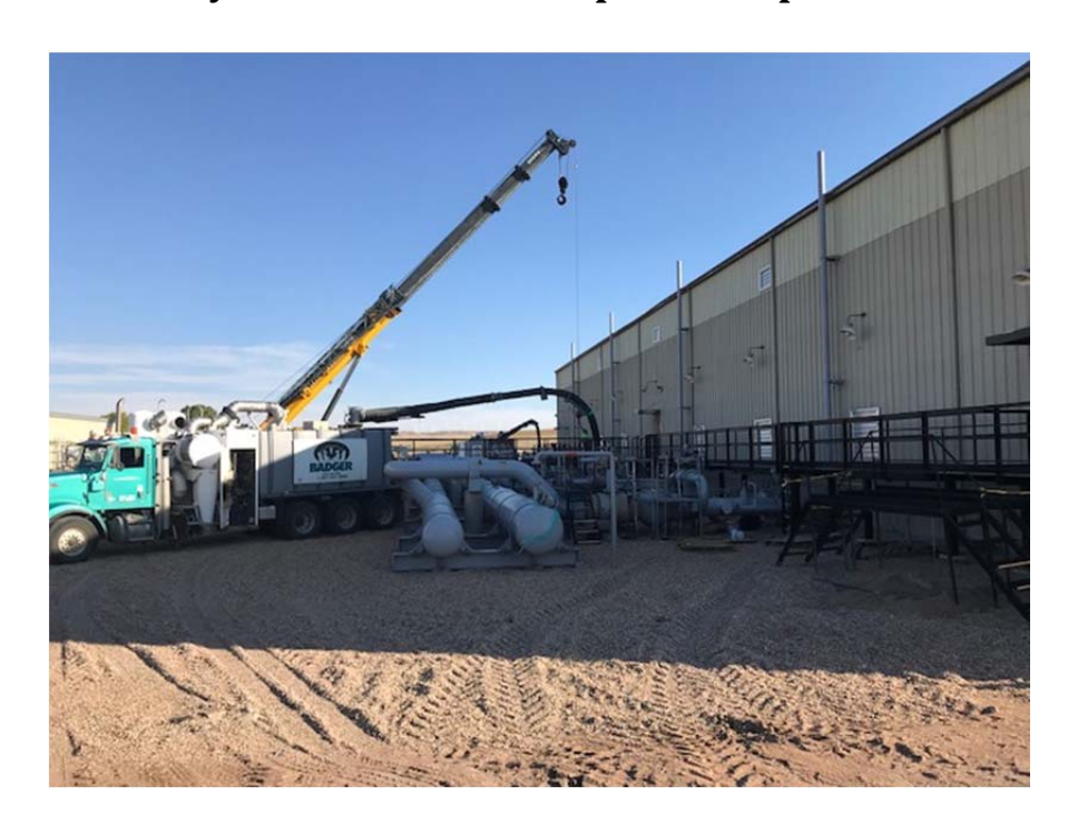
Preparing for hydro test