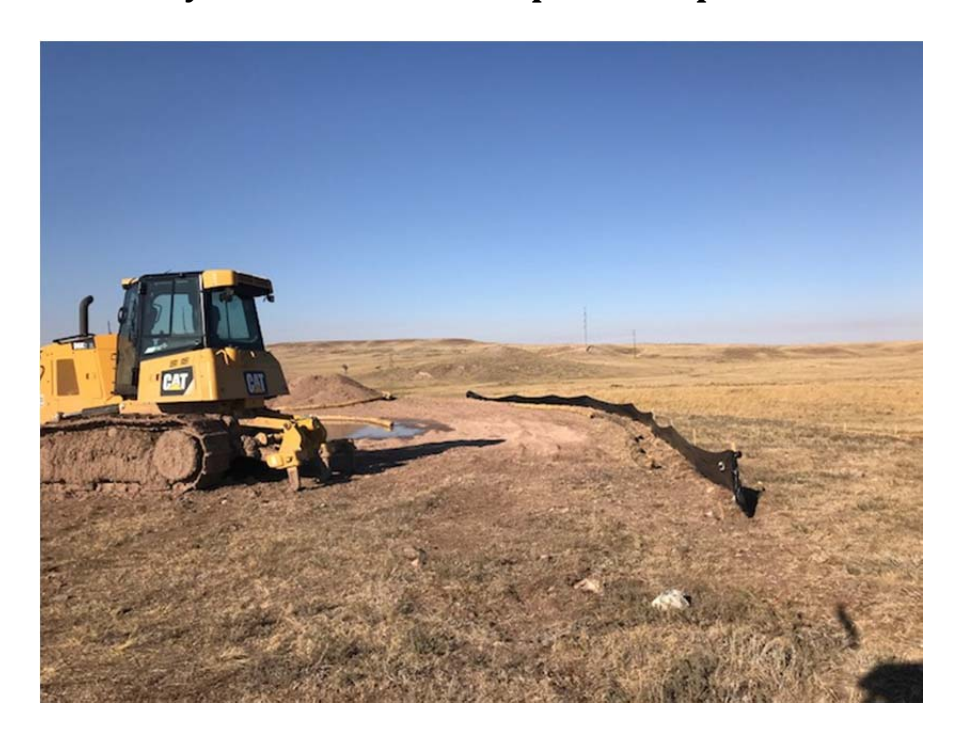
Sediment control devices